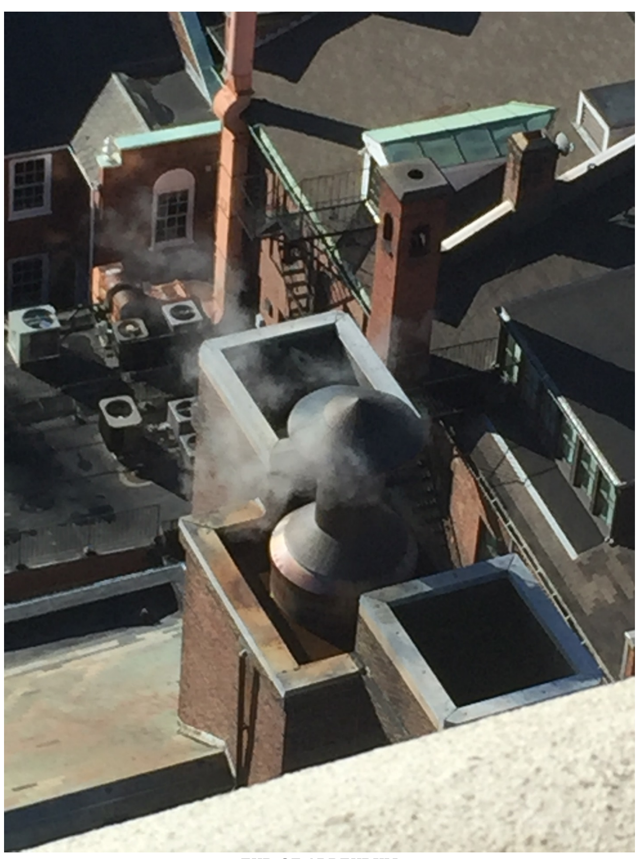
END OF ADDENDUM