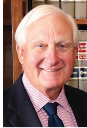
Paul A. Suttell Chief Justice

Jury service is not only a duty and privilege of citizenship, it is essential to our system of justice. In criminal prosecutions jurors protect the innocent and preserve individual freedom; in civil trials they ensure that the facts will be determined fairly and impartially. I hope that you find your jury service to be an interesting and rewarding experience.